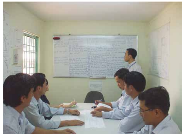
JSA for a steel structure