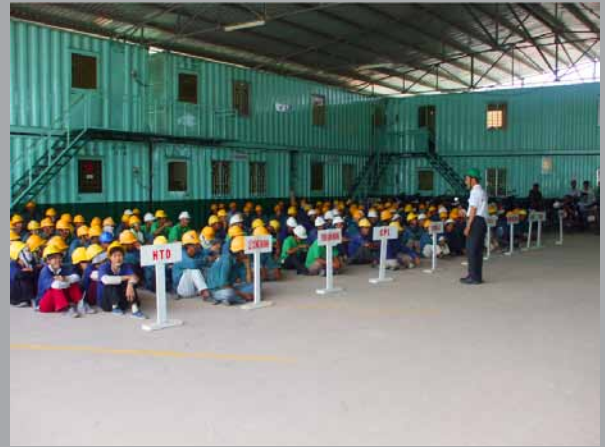
Weekly refreshment training

Based upon the Royal Haskoning regional HSE management system, Haskoning Vietnam's HSE management team has developed a system suited to the local Vietnamese construction practices with a practical and hands-on approach.